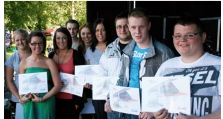
Integrated Services Bursary Awards 2009

Bursaries have been established to enable young people to access progression routes and take advantage of life chances and enhance employability.